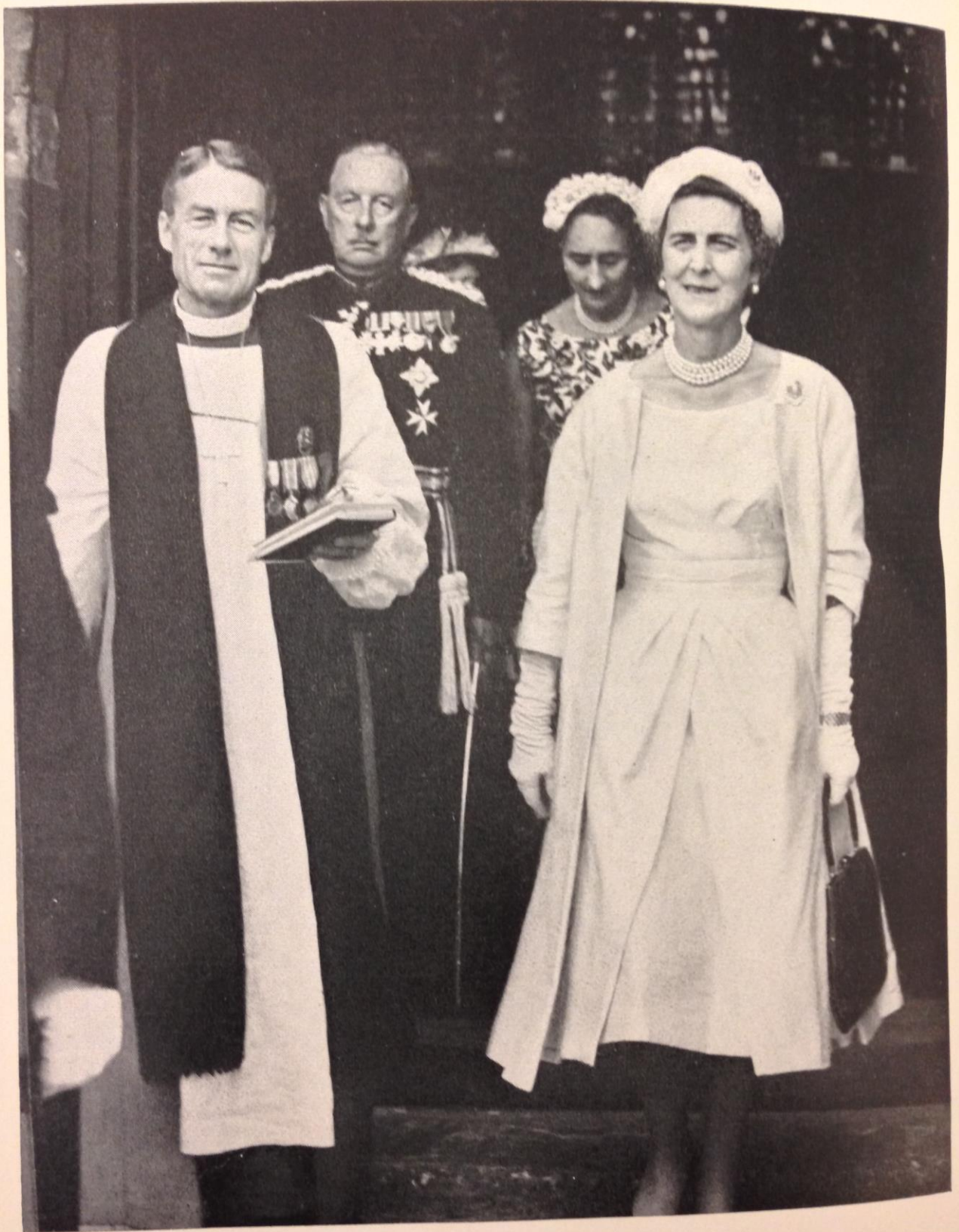
H.R.H. the Duchess of Kent leaving the Cathedral with the Dean after Festival Evensong 18th July 1959