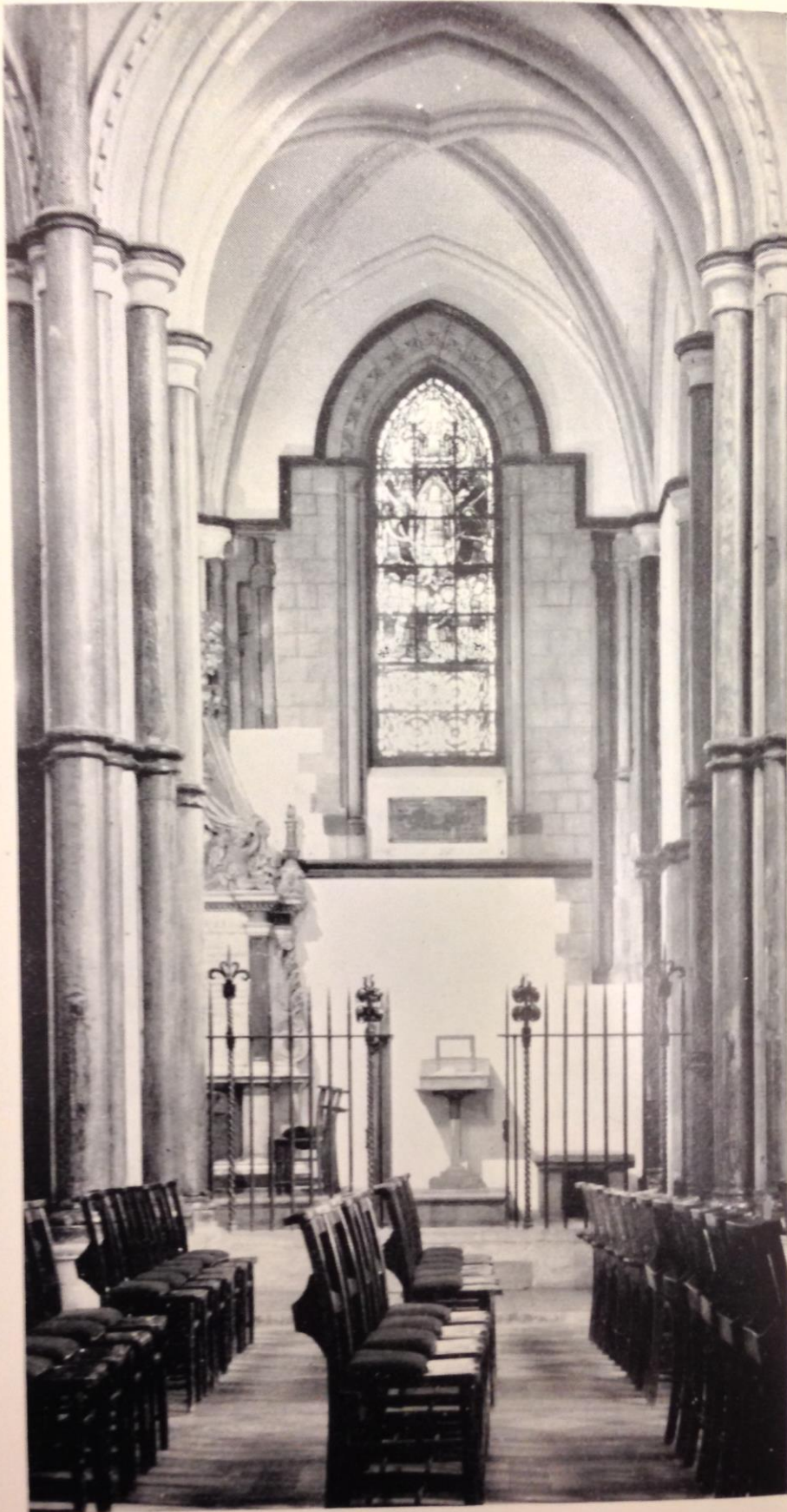
St. John the Baptist Chapel with the Book of Memory