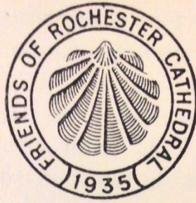
Badge of the Friends of Rochester Cathedral