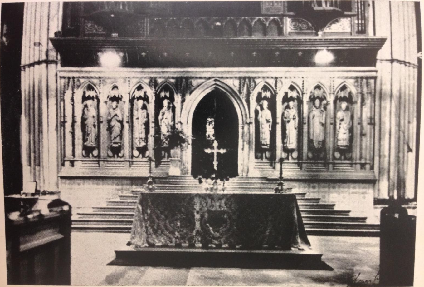
THE NAVE ALTAR (Bishop Harmer Memorial).